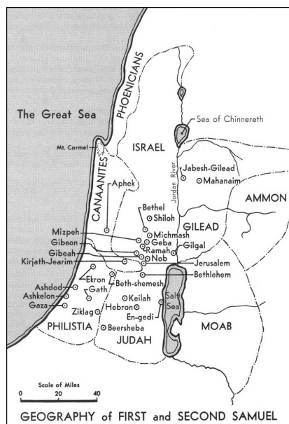
Map of David's Kingdom-ESV Global